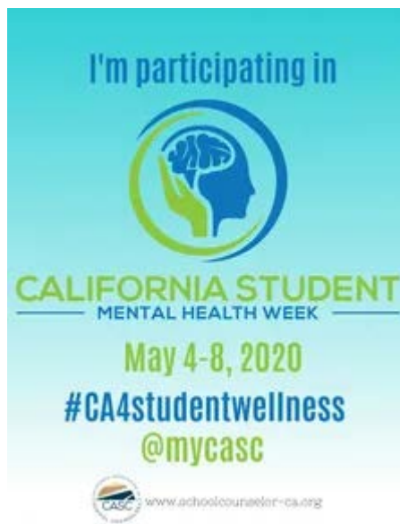
I am participating in CASMHW

Post an Instagram Story Photo below to your story to raise awareness.